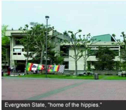
Evergreen State, "home of the hippies."

$12,264 non-resident tuition Fiske rates it the #4 public liberal-arts college; student-to-faculty ratio: 22 to 1 evergreen.edu